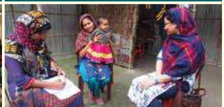
Public Health Multi-Disciplinary Learning®