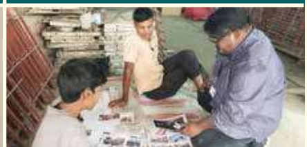
Peer Learning, Feedback, and Critique