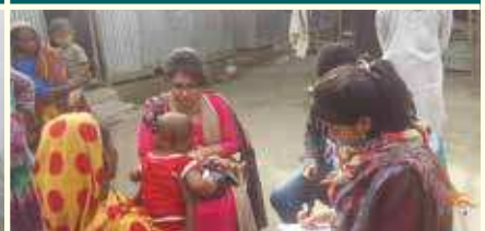
Integrative Public Health Thematic Learning©