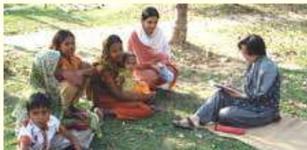
Immersive Urban Community and health service Fieldwork®

Communities within urban and rural environments; public health stakeholders and institutions; health and development practitioners and researchers; together form the foundational learning praxis for students throughout the year. All the learning methodologies are integrated with this cutting-edge pedagogic model for students to intellectually process and analyze public health realities unfolding in real-time.