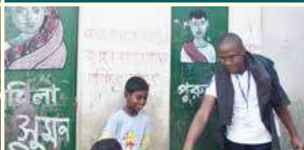
Integrative Learning Frameworks for Public health solutions©