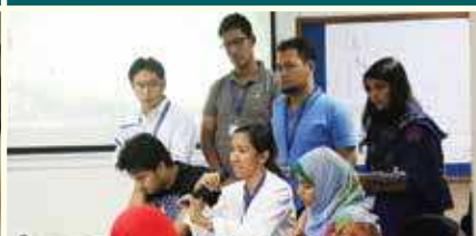
Team Project Presentations