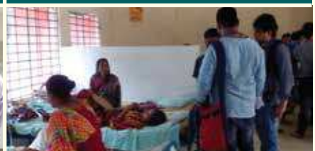
Health Services Interviews, Dialogues and Investigations©