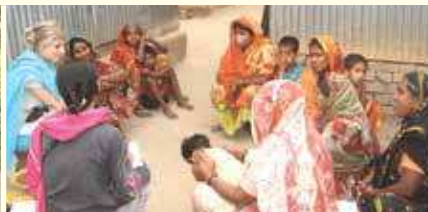
Urban Community Context-Based Learning®