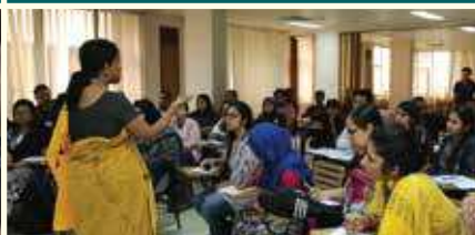
Public Health Management Solutions Project®