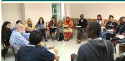
Real-World Simulations & Role-Playing