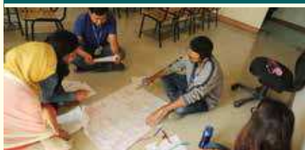
Cumulative Applied Learning©