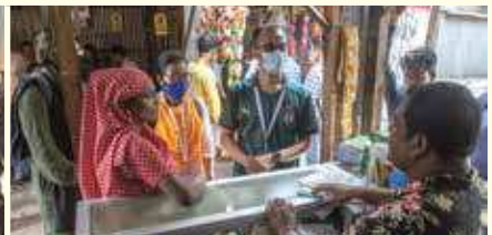
Immersive Rural Community and health service Fieldwork