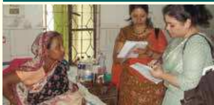
Facilitated and Guided Experiential learning®