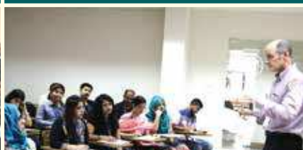
Global Integrative Case Studies