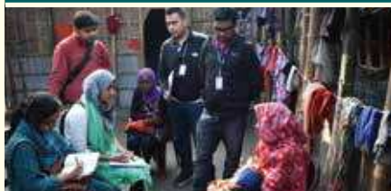
Rural Community Context-Based Learning®